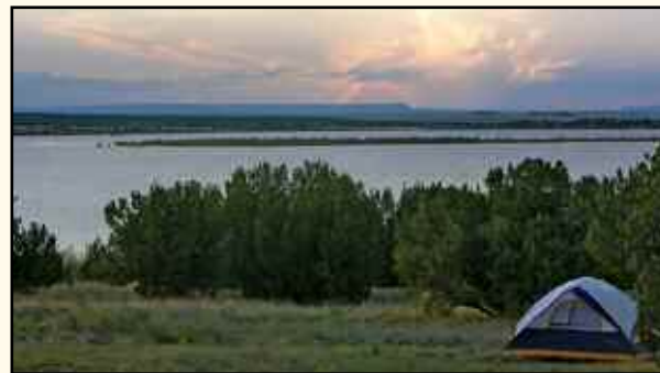
Santa Rosa State Park is only an hour from Tucumcari.