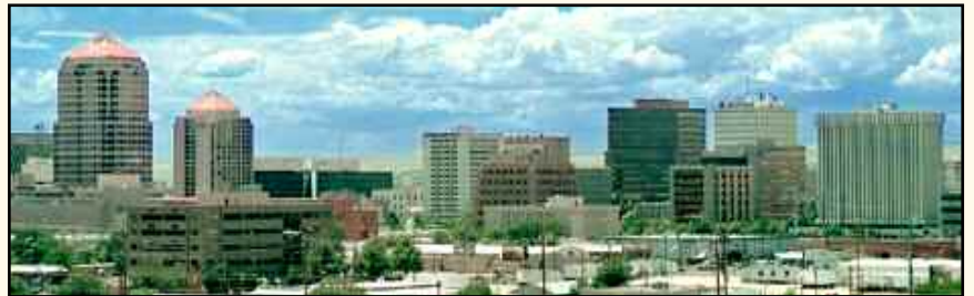
Albuquerque is only a couple of hours away from the ranch.

Near Las Vegas, NM, the lake's serene waters are open for fishing year-round. Storrie Lake boasts consistent winds that provide excellent conditions for sailing and windsurfing. With the arrival of the Santa Fe Railway in 1879, Las Vegas and the surrounding area became a hangout of some the shadiest characters of the Old West, including Doc Holliday, Billy the Kid and Wyatt Erp. The visitor center features historical exhibits about the Santa Fe Trail and 19th century. Birdwatching is a must in order to view the geese and ducks that flock to the lake during seasonal migrations. Follow walking-trails through sagebrush-covered landscape spotted with cactus, yucca and wildflowers.