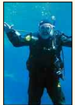
Scuba diver at Santa Rosa State Park