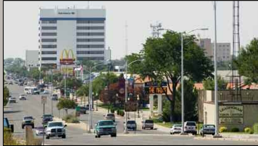
A view down Roswell's Main Street.

There's much more to do in this All-America City. If your cup of tea is stargazing and planet exploration, the Robert H. Goddard Planetarium is an exciting choice. Bird watchers and wildlife aficionados will relish trips to Bitter Lake Wildlife Refuge with its designated fishing and hunting areas and flocks of migratory fowl. The Spring River Park and Zoo boasts animal exhibits, paved bicycle paths, a children's fishing lake, a carousel, and a miniature train ride. Golfers will enjoy two of the finest courses in Southeast New Mexico: Cahoon Park, an 18-hole golf course open to the public and New Mexico Military Institute's 18-hole course, also open to the public.