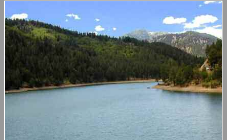
Bonita Lake, located near Ruidoso, New Mexico, is a couple hours away from the Gallo Creek Ranch. The world-famous Inn of the Mountain Gods in Ruidoso is pictured below.

Fast horses and hot slots are the name of the game at Ruidoso Downs Race Track and Casino. The first race at Ruidoso Downs Race Track was run in 1947, then in 1999, a new era of racing in New Mexico began with the legalization of slot machine casinos at race tracks. The Billy the Kid Casino opened in May of 1999 and houses over 300 slot machines. The casino is open daily and, in 2006, paid out over $100 million in winnings. Racing in the mountains takes place annually from Memorial Day to Labor Day, culminating with the $2 million All American Futurity.