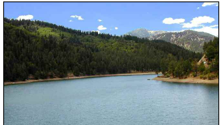
Ruidoso is famous for its natural beauty, outdoor activities and is home to the Inn of the Mountain Gods, a 5-star resort/casino.