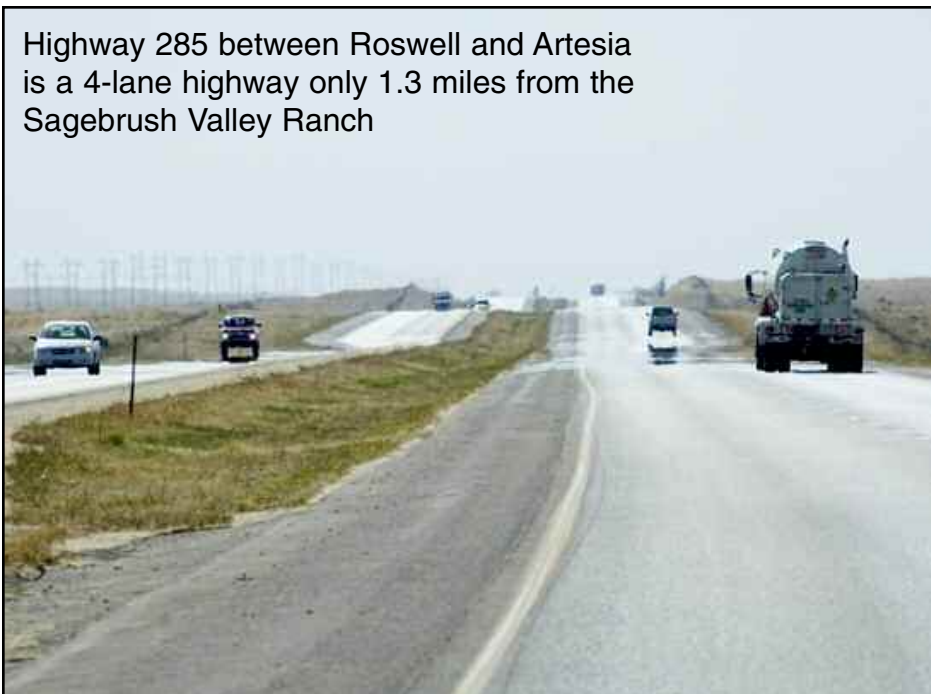
Highway 285 between Roswell and Artesia is a 4-lane highway only 1.3 miles from the Sagebrush Valley Ranch