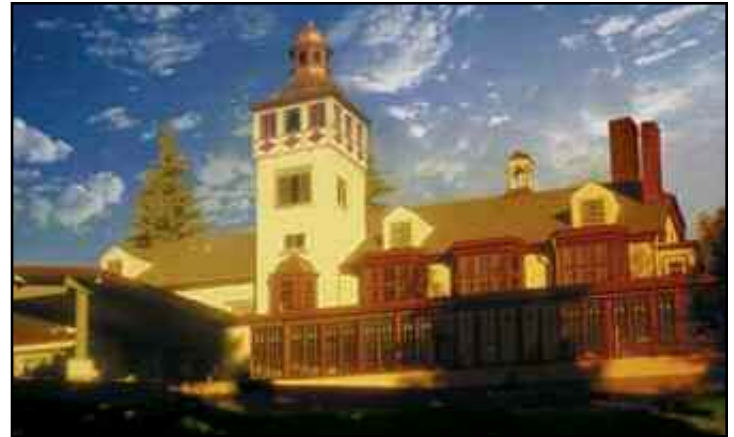
The Lodge in Cloudcroft is not far from Sagebrush Valley. This prestigious resort is well-known for its magical atmosphere.

In just a little over three hours, you can make the drive from Sagebrush Valley to Albuquerque and Santa Fe, two of the economic and cultural meccas in all the Southwest. Albuquerque and its 700,000 residents offer all you could want in shopping and entertainment, while Santa Fe draws visitors worldwide to its world-class art galleries.