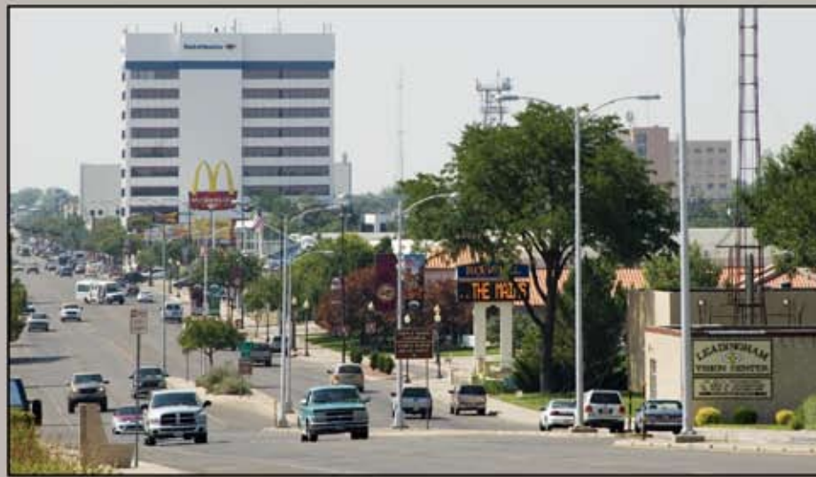
A view down Main Street.

The city of Roswell and Chaves County have been important historical sites throughout the history of human habitation in North America. Roswell, situated at the confluence of three rivers – the Spring, the Hondo, the Pecos – was established in 1870 by Van Smith, although the first historically documented settlement (1867) in the area was a settlement of crude adobe huts at “Rio Hondo,” the present day neighborhood of Chihuahuita. The Roswell and Chaves County area was contained within the original homeland of the Mescalero