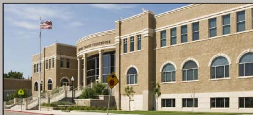
The Chaves County Courthouse.