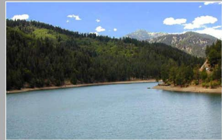
Bonita Lake, located near Ruidoso, New Mexico, is a couple hours away from the Gallo Creek Ranch. The world-famous Inn of the Mountain Gods in Ruidoso is pictured below.

Ruidoso Downs Race Track & Casino Fast horses and hot slots are the name of the game at Ruidoso Downs Race Track and Casino. The first race at Ruidoso Downs Race Track was run in 1947, then in 1999, a new era of racing in New Mexico began with the legalization of slot machine casinos at race tracks. The Billy the Kid Casino opened in May of 1999 and houses over 300 slot machines. The casino is open daily and, in 2006, paid out over $100 million in winnings. Racing in the mountains takes place annually from Memorial Day to Labor Day, culminating with the $2 million All American Futurity.