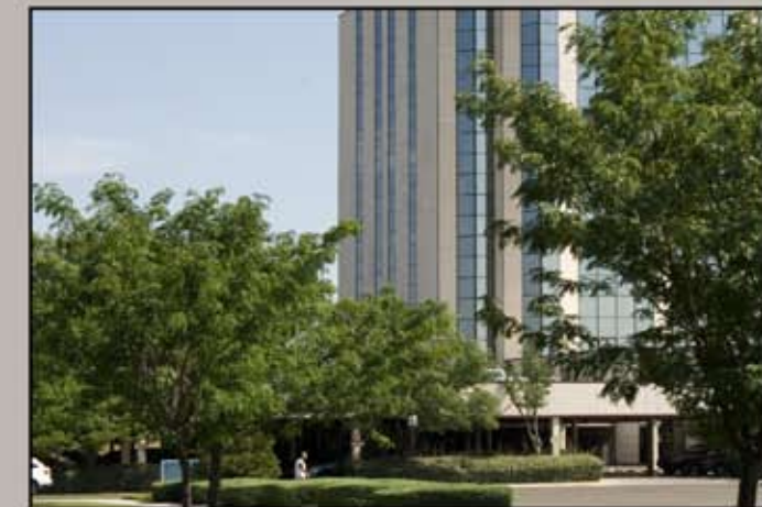
Wells Fargo Bank Building in downtown Roswell.