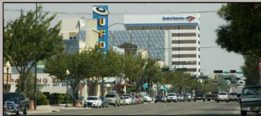
Downtown Roswell which houses the famous UFO Museum.

There’s much more to do in this All-America City. If your cup of tea is stargazing and planet exploration, the Robert H. Goddard Planetarium is an exciting choice. Bird watchers and wildlife aficionados will relish trips to Bitter Lake Wildlife Refuge with its designated fishing and hunting areas and flocks of migratory fowl. The Spring River Park and Zoo boasts animal exhibits, paved bicycle paths, a children’s fishing lake, a carousel, and a miniature train ride. Golfers will enjoy two of the finest courses in Southeast New Mexico: Cahoon Park, an 18-hole golf course open to the public and New Mexico Military Institute’s 18-hole course also open to the public.