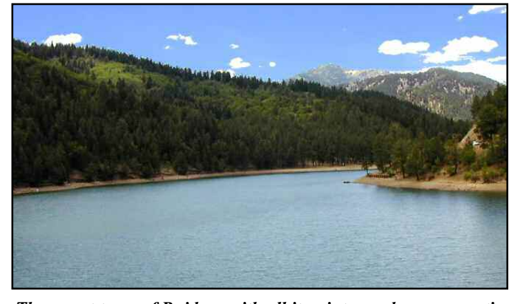
The resort town of Ruidoso with all its winter and summer activities is just 70 m iles west of Roswell on Highway 70.

Less than two hours northwest of the Buck Passer Ranch you will find Albuquerque and Santa Fe, two of the economic and cultural meccas in all the Southwest. Albuquerque and its 700,000 residents offer all you could want in shopping and entertainment, while Santa Fe draws visitors worldwide to its world-class art galleries.