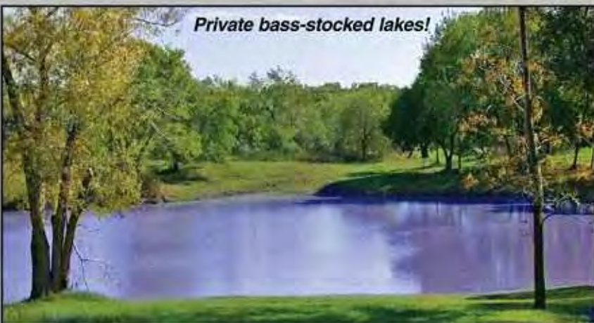
Private bass-stocked lakes!