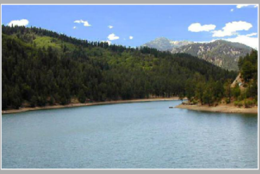
Routta Lake, breated near Ruidson, New Mexica, is a comple hours away from the Galla Creek Ranch. The world-famous Inn of the Mountain Gods in Raidosa is pictured below.

the came at Ruidoso Downs Race Track and Casmo. The first race at Ruidoso Downs Race Track was run in 1947, then in 1999, a new era of racing in New Mexico began with the legalization of slot machine casinos at race tracks. The Billy the Kid Casino opened in May of 1999 and houses over 300 slot machines. The casino is open daily and, in 2006, paid out over $100 million in winnings. Racing in the mountains takes place annually from Memorial Day to Labor Day, culminating with the $2 million All American Futurity.