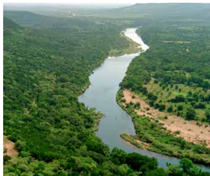
Brazos River downstream of Possum Kingdom Lake (Palo Pinto County, Texas)

Brazos River Canoeing is a very popular recreational activity on the Brazos River with many locations favorable for launching and recovery. The best paddling can be found immediately below Possum Kingdom Lake and Lake Granbury. Sandbar Camping is also permitted since the entire streambed of the river is considered to be state-owned public property. Fishing, camping, and picnicking are legal here, including on the sandbars. Outdoor enthusiasts enjoy the opportunity to find beautiful scenery and abundant wildlife on the river. Fly fishing and river fishing for largemouth bass are popular.