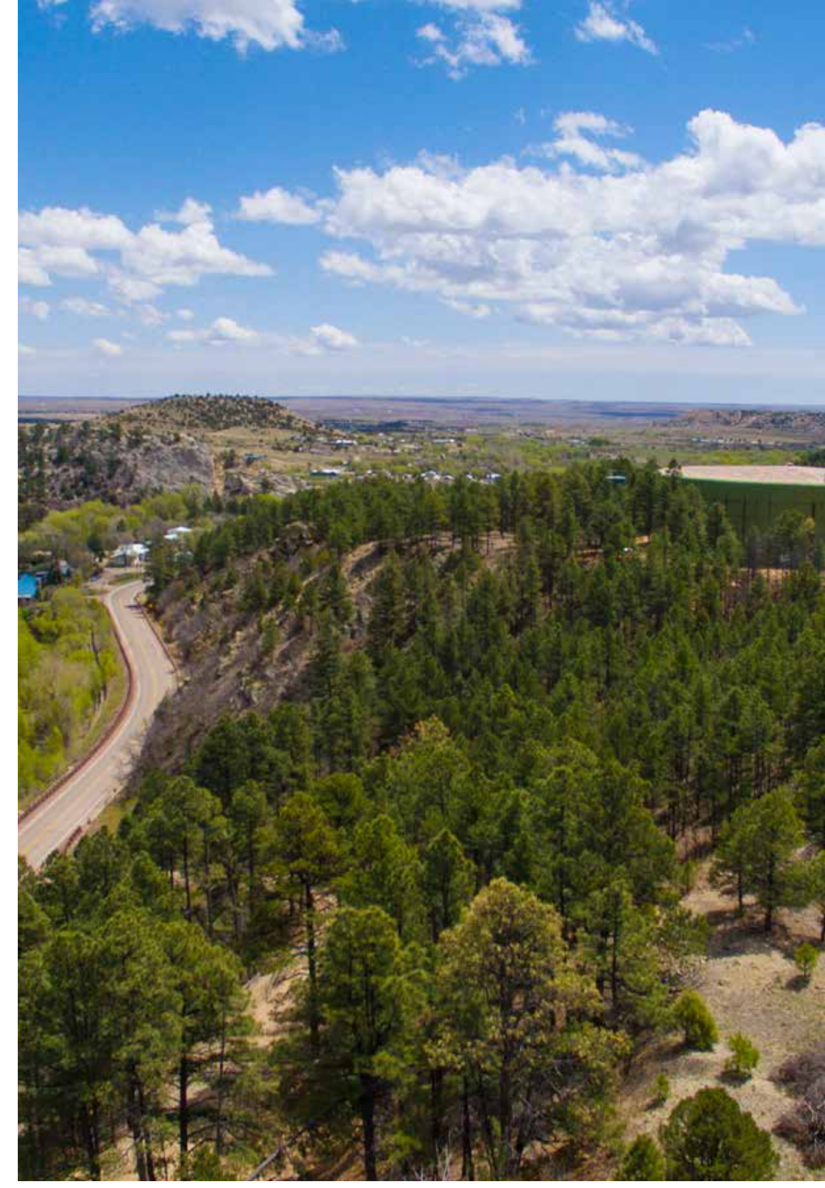
The 1040 acres MOL ranch is truly that one of a kind hideaway with all the conveniences, even city water service.