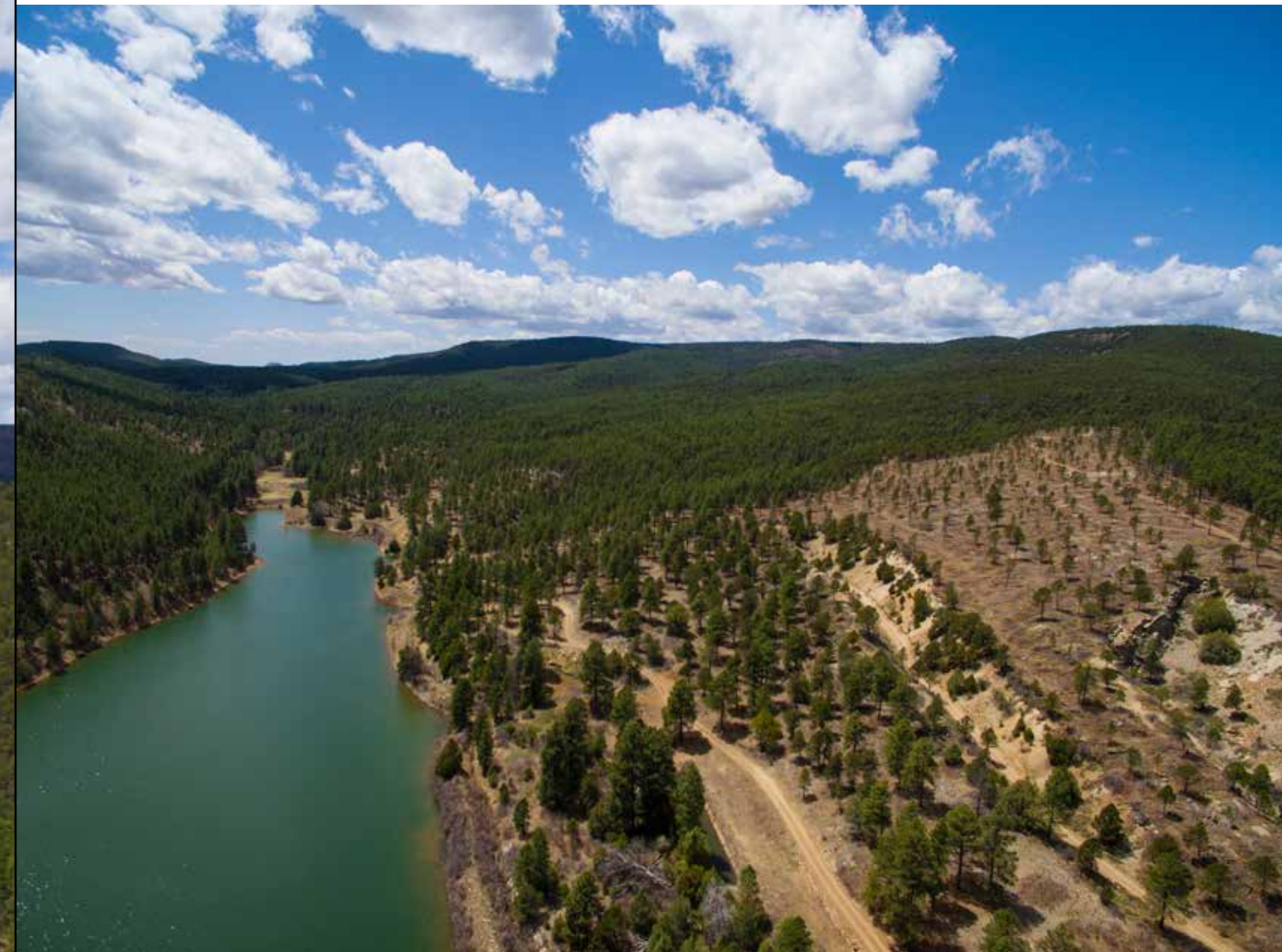
Beautiful Hot Springs Ranch located just minutes from Las Vegas, New Mexico with paved road access via State Highway 65.