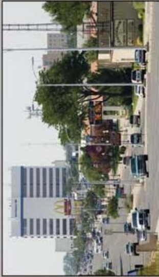
A view down Main Street.

There’s much more to do in this All-America City. If your cup of tea is stargazing and planet exploration, the Robert H. Goddard Planetarium is an exciting choice. Bird watchers and wildlife aficionados will relish trips to Bitter Lake Wildlife Refuge with its designated fishing and hunting areas and stocks of migratory fowl. The Spring River Park and Zoo boasts animal exhibits, paved bicycle paths, a children’s fishing lake, a carousel, and a miniature train ride. Golfers will enjoy two of the finest courses in Southeast New Mexico: Calhoun Park, an 18-hole golf course open to the public and New Mexico Military Institute’s 18-hole course also open to the public.