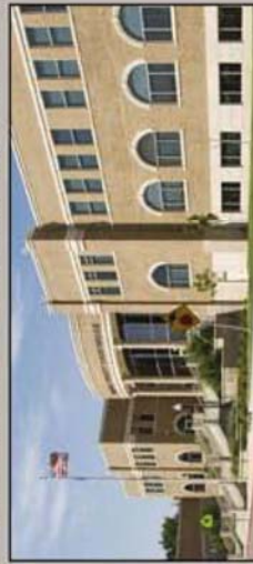
The Chaves County Courthouse.