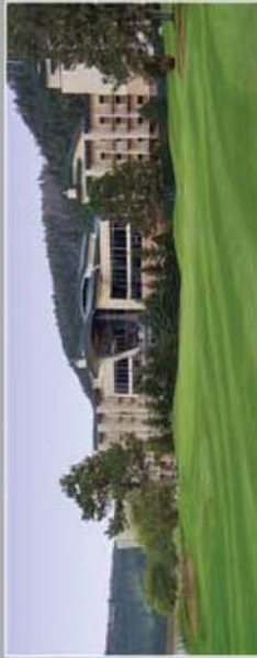
Bonita Lake, located near Ruidoso, New Mexico, is a couple hours away from the Gallo Creek Ranch. The world-famous Inn of the Mountain Gods in Ruidoso is pictured below.