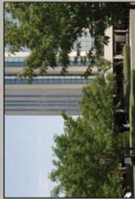
Wells Fargo Bank Building in downtown Roswell.