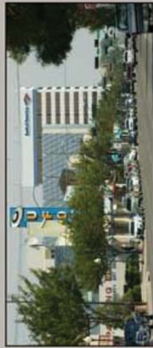
Downtown Roswell which houses the famous UFO Museum.